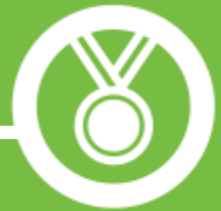
High Performance Coaching